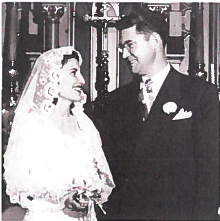
The beautiful bride with her soul mate on their wedding day in August 16, 1949.